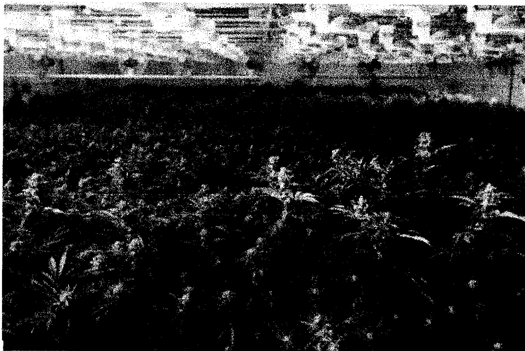
Marijuana plants in a grow room in Quincy operated by Ermont, one of a handful of companies with financial ties to Sea Hunter Therapeutics.

Sea Hunter and its affiliated companies have just two stores open so far, a medical dispensary in Quincy and one in Taunton, along with pot-growing facilities at each. But it is shepherding at least 11 more retail locations through the licensing pipeline, under five different company names.